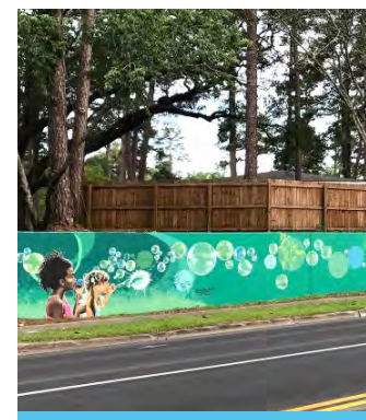
Life is Sound. May 2022. Corner of High Road and Croydon Drive.