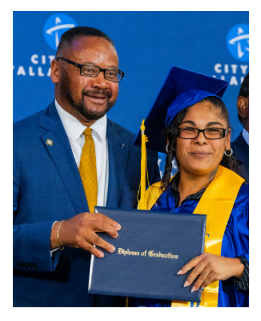
TEMPO also received a 100% increase in funding from the State of Florida, from $250k to $500k .

participants received technical certificates from Lively Technical and Tallahassee Community colleges.