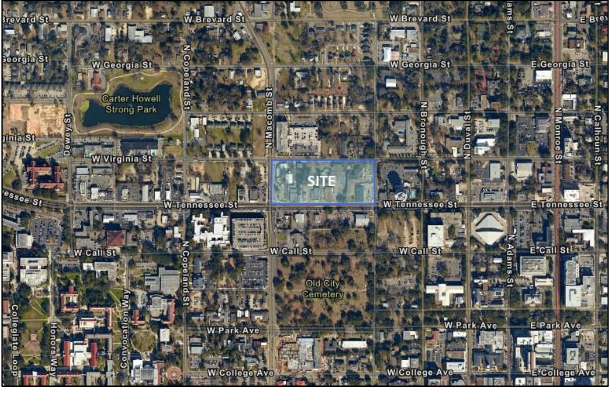
Figure 2.1 Shelter Site Location